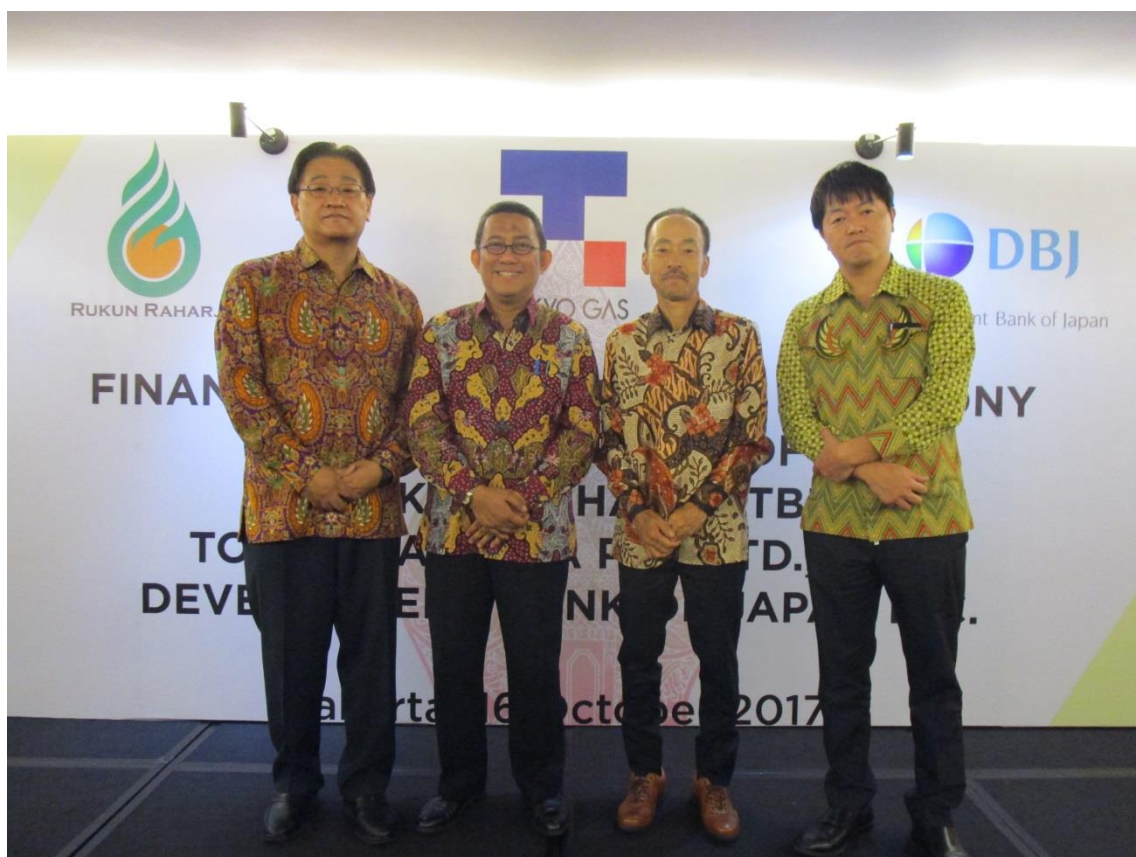
Picture from Closing Ceremony