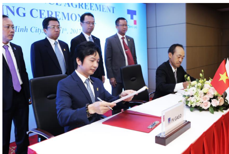
Picture from SAA Signing Ceremony