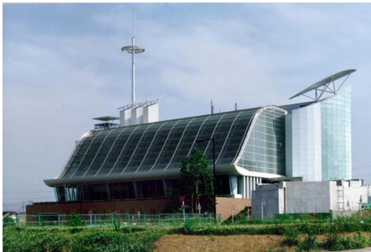
*Photo taken in 1996 upon completion of the building construction.