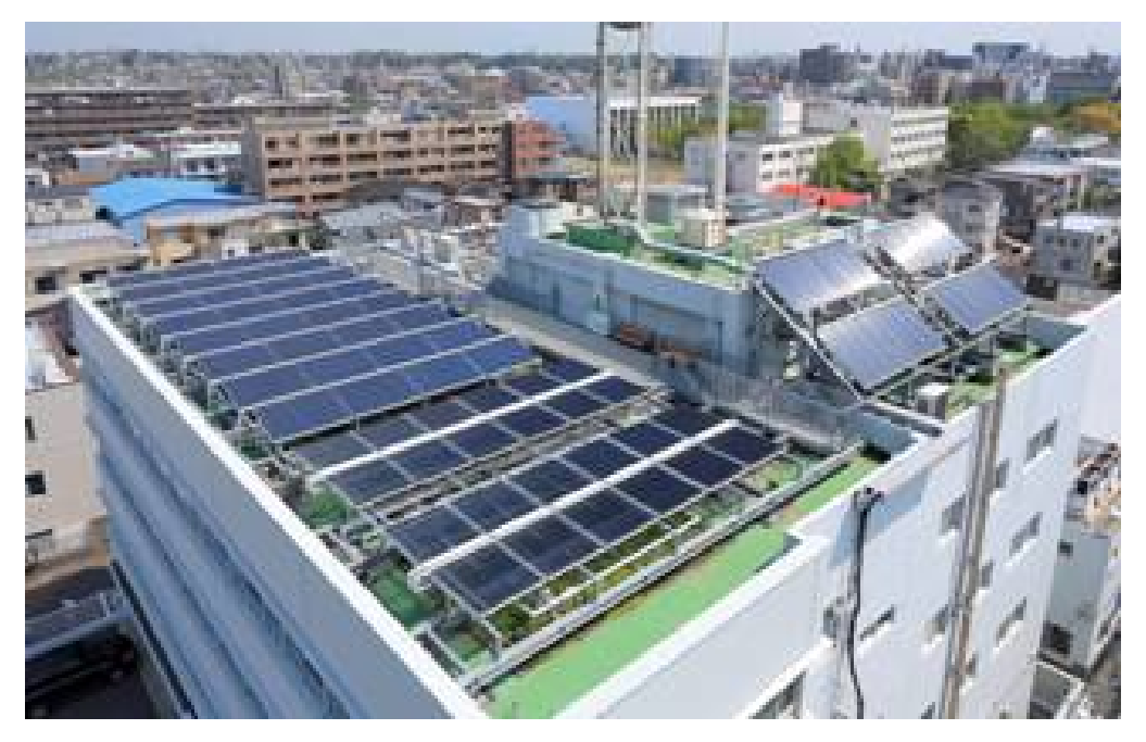
Tokyo Gas Nakahara Building (solar cooling system demonstration plant)