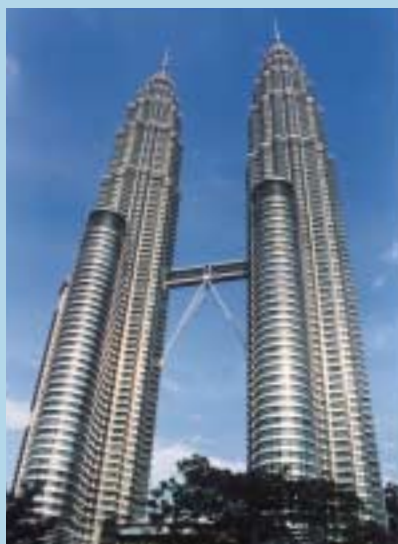
The Petronas Twin Towers, the tallest buildings in the world, are supplied with chilled water by a gas district cooling (GDC) system.

infrastructure. In 1999, Gas Malaysia started paying dividends. The gas-fired cogeneration district cooling project was another joint venture with Petronas through Gas District Cooling (M) Sdn. Bhd. Thanks to this project, Malaysia's Kuala Lumpur International Airport (KLIA), which opened in June 1998, boasts the world's largest class of gas district cooling supply, based on gas absorption chillers. Kuala Lumpur City Center (KLCC), including the Petronas Twin Towers have benefited as well from the company's gas cooling technologies. Meanwhile, Tokyo Gas Engineering Co., Ltd. has been providing technical consultation, for example, for the establishment of LNG receiving facilities in Korea, Taiwan, Thailand, and Portugal. Tokyo Gas is leveraging experience and technology from its Negishi, Sodegaura and Ohgishima LNG terminals. Moving forward, Tokyo Gas intends to identify and develop business